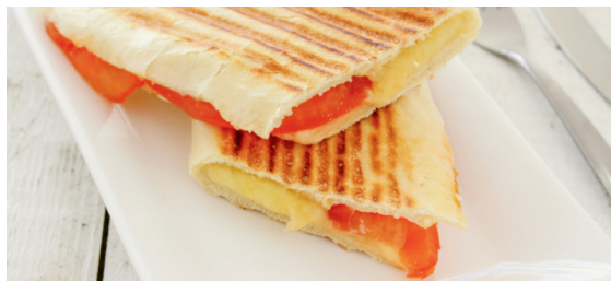
Cheese & Tomato Panini