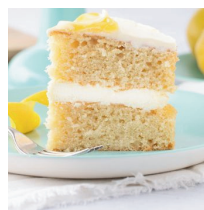
Double Lemon Cake