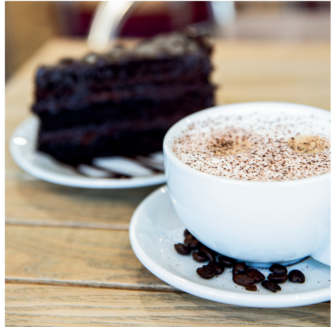
Cappuccino &amp; Chocolate Fudge Cake