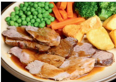
Traditional Sunday Roast

A delicious mushroom, cranberry and brie wellington served with a Yorkshire pudding, roast potatoes, gravy and a selection of vegetables