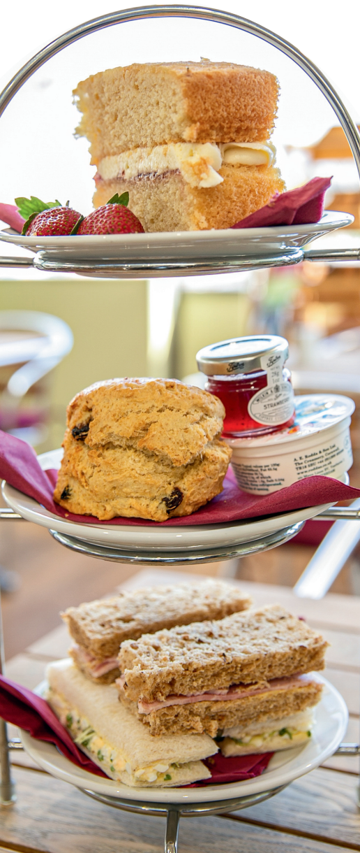
Luxury Cream Tea

Teatime is the right time, and what better way to while away an afternoon than right here in The Garden Restaurant with the delights of the garden centre all around you? Make sure to have a look at our delicious cake counter too!