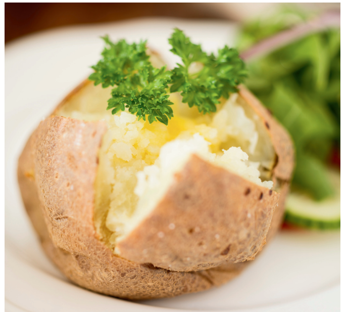
Hot-buttered Jacket Potato