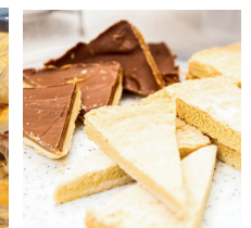
Millionaire's Shortbread & Shortbread

HOW TO ORDER: Please order & pay at the counter & remember to give your table number