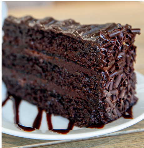
Chocolate Fudge Cake