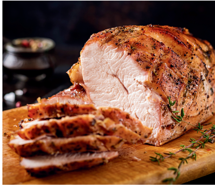
Traditional Sunday Roast

Choice of home cooked meats, served with Yorkshire pudding, roast potatoes, gravy and a selection of vegetables