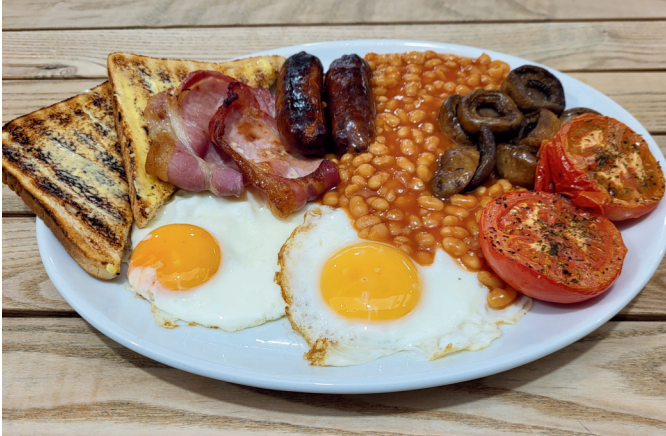
Brick Kiln Big Breakfast

2 fried or scrambled eggs, 2 veggie sausages, baked beans, buttered spinach, roast tomato, herby mushrooms & toast