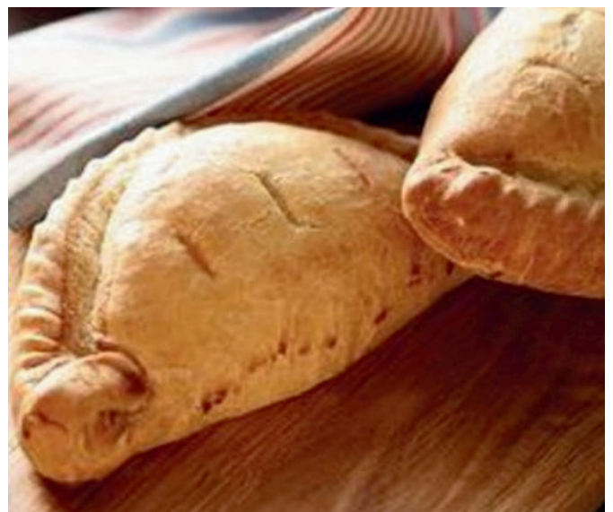
Traditional Cornish Mixed Steak Pasty