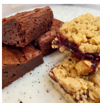
Fudge Brownie & Blackcurrant Crumble