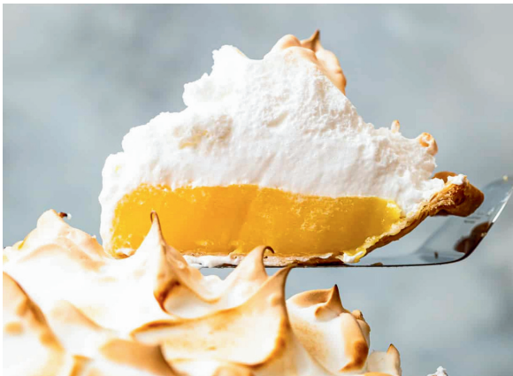
Lemon Meringue Pie

Served with strawberry or chocolate topping