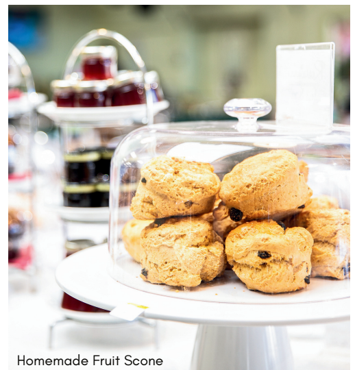
Homemade Fruit Scone

HOW TO ORDER: Please order & pay at the counter & remember to give your table number