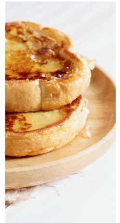
2 slices of toast