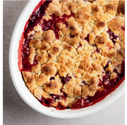
Chef's Crumble of the Day