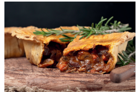
Chef's Pie of the Day